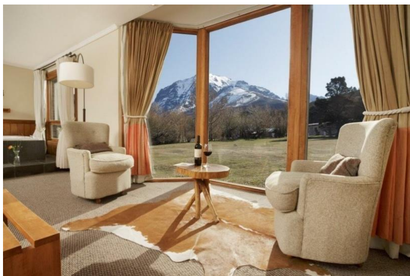
Hotel Las Torres – Suite

November 6, 2018 | Africa, America, Asia, Australia, Europe, India, Industry News, Middle East, New Zealand | No comments